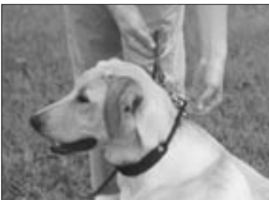
3. The collar should be snug, but not tight around your dog's neck. Add or remove links as needed to ensure proper fit. Snap the end of your leash to the 0-ring swivel.