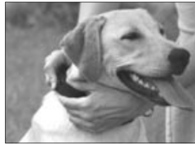
4. To remove the Triple Crown Collar™, use your thumb and forefinger to unsnap the links. *Do not slip the Triple Crown Collar™ over your dog's head.