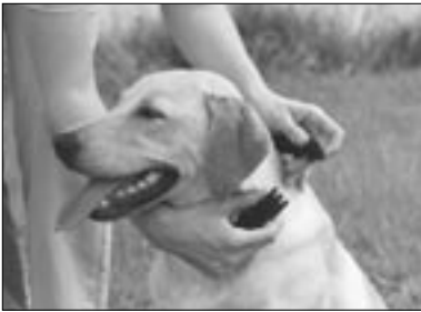
1. Unsnap the Triple Crown Collar™ at any link.