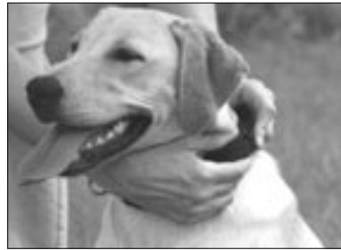
2. Using your thumb and forefinger, snap the links together. Then position the collar so the cord rests at the top of your dog's neck.