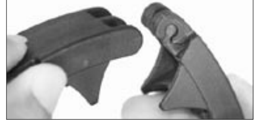
Unsnap the links using a firm left-to-right rocking motion